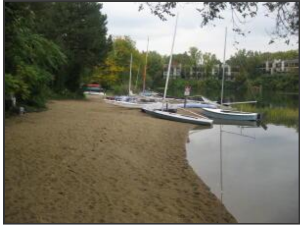
Same and Boat Storage