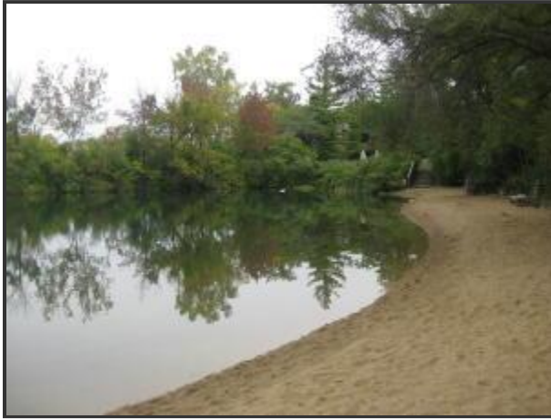
Beach by the Pool