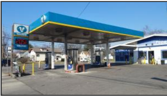
Oakland Park Front New