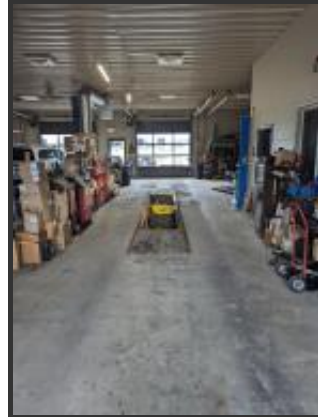
PXL 20231014 195307679 copy